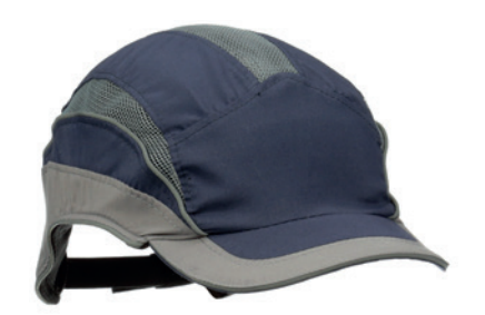
3M™ First Base™ 3 Elite Bump Cap

Lightweight cap with micro-fibre fabric and flexible shell design.