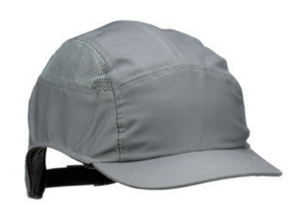
3M™ First Base™ 3 Extra Bump Cap

Dual colour micro-fibre cap with reflective piping and flexible shell design.