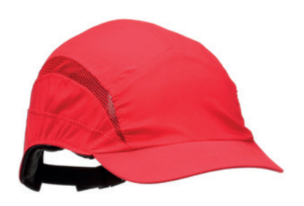
3M<sup>™</sup> First Base<sup>™</sup> 3 Classic Bump Cap

Lightweight cap with micro-fibre fabric and flexible shell design.